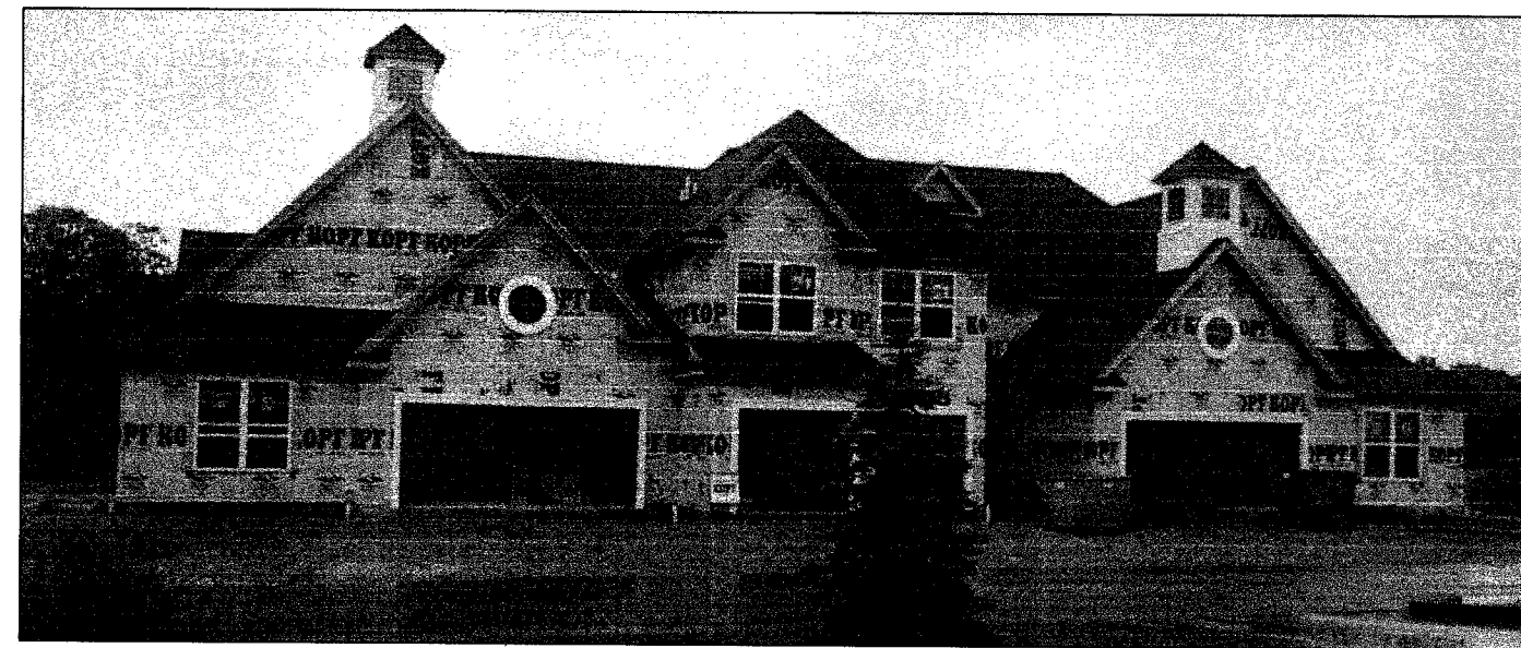
BUILDING 19 FRONT