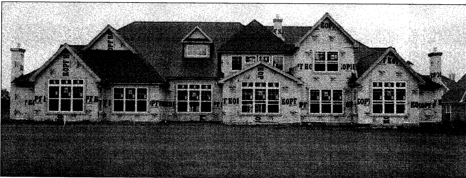
BUILDING 19 REAR